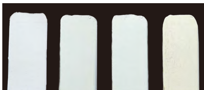
Permanent White SF Safflower oil Poppy oil Linseed oil

The degree of yellowing was photographed after 2 months of application of a 2:1 mixture of white ( Holbein Permanent White SF) and different oils, which is the easiest way to see yellowing difference. There is little compositional difference between poppy oil and safflower oil, and visual inspection confirms that there is no difference.